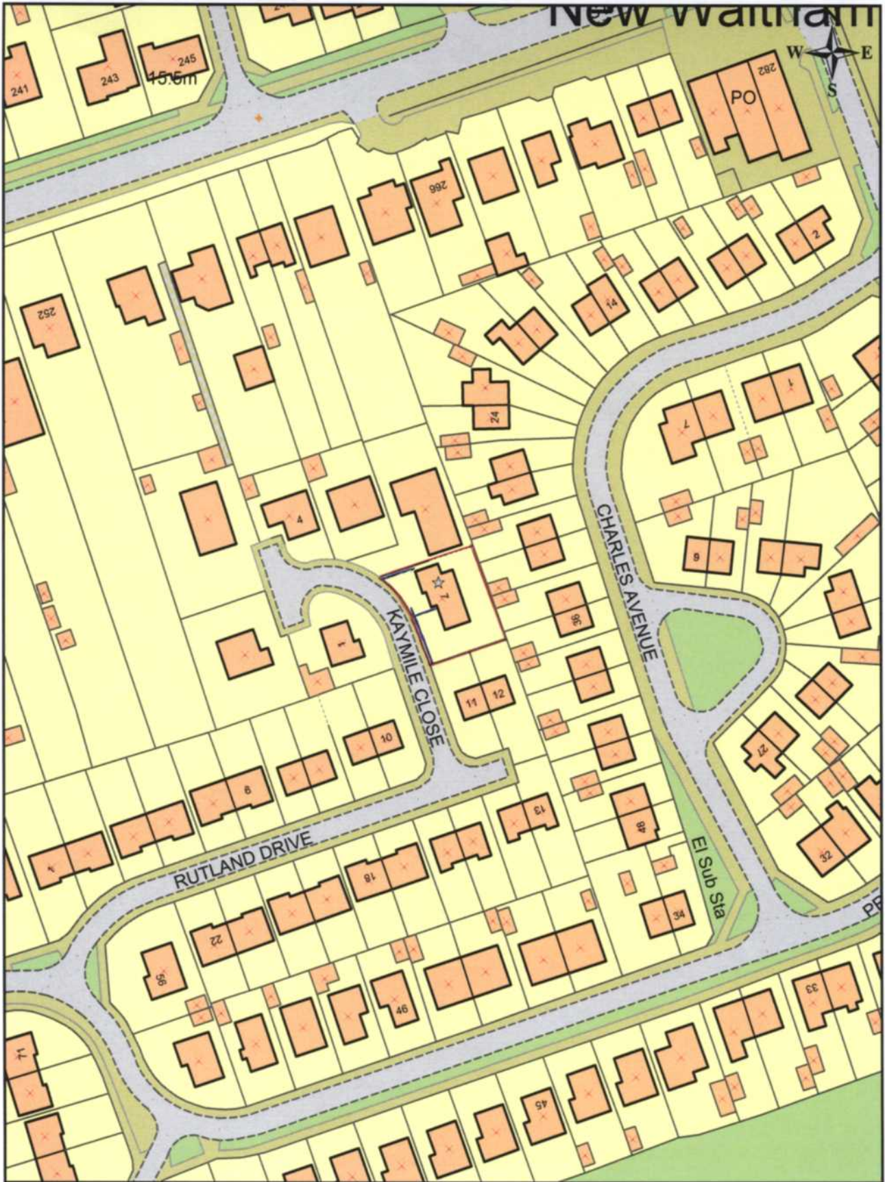
Title: 7 Kaymile Close Date: 02/11/2006 Scale: 1:1250 www 5L 2000 No Window