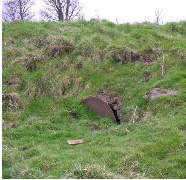
Photograph 11 Gap allowing entrance to tunnels