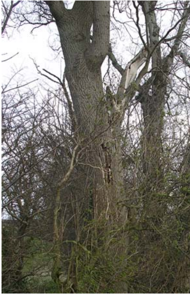
Photograph 10 Ash tree with splits