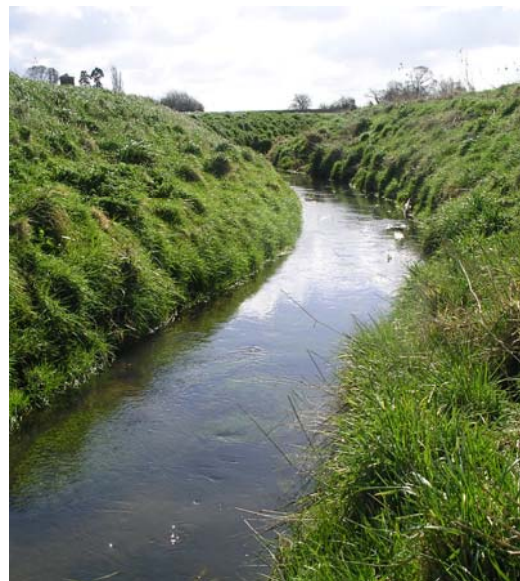
Photographs 8 and 9 Views of North Beck Drain