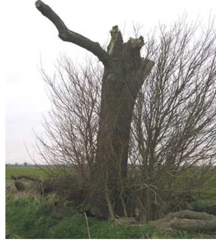
Photograph 2 Tree stump on grass bank