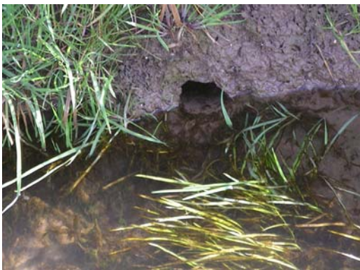
Photograph 12 Water vole burrow, North Beck Drain