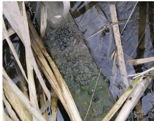
Photograph 13 Water vole latrine, Drain 2