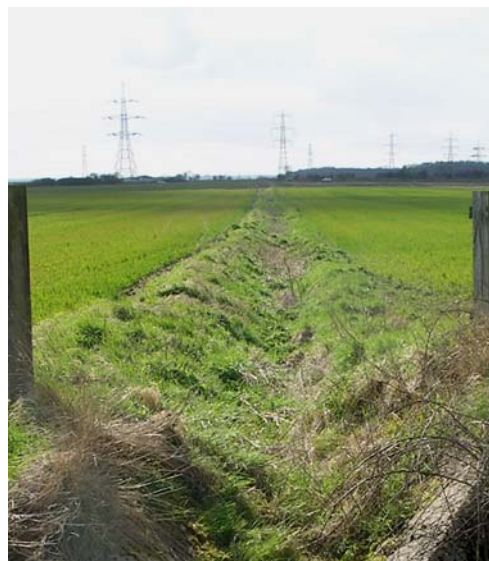
Photographs 3 and 4. Dry ditches with low grass banks dividing the arable fields.