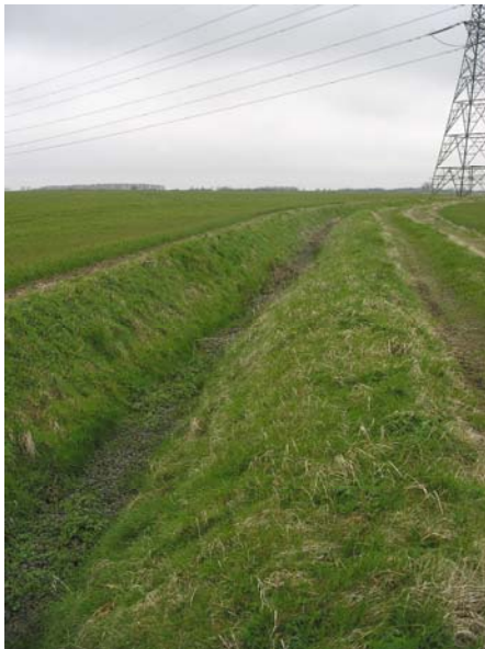
Photograph 6 Mid section of Drain 4