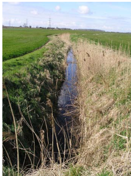
Photograph 7 Eastern end of Drain 4t