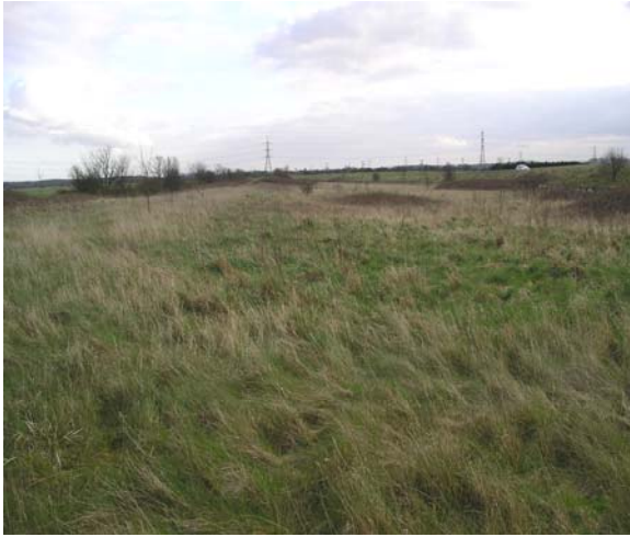
Photograph 1 Rough grassland strip from the south