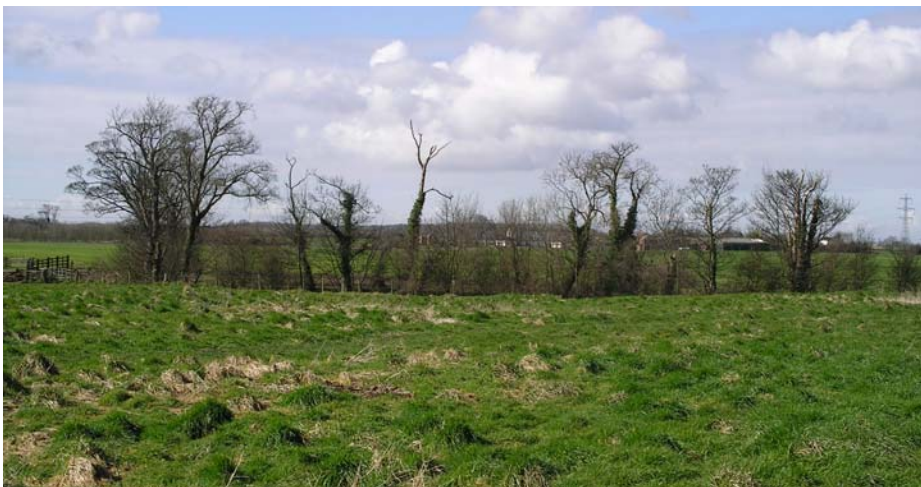
Photograph 5 View west across the pasture to a line of mature ash trees on North Beck Drain