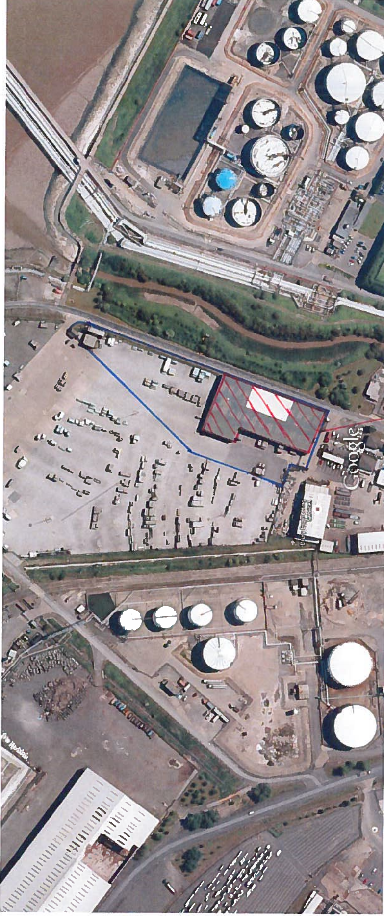
Imagery ©2015 Getmapping plc, Map data ©2015 Google 20 m

Cookies help us deliver our services. By using our services, you agree to our use of cookies. Learn more Got it