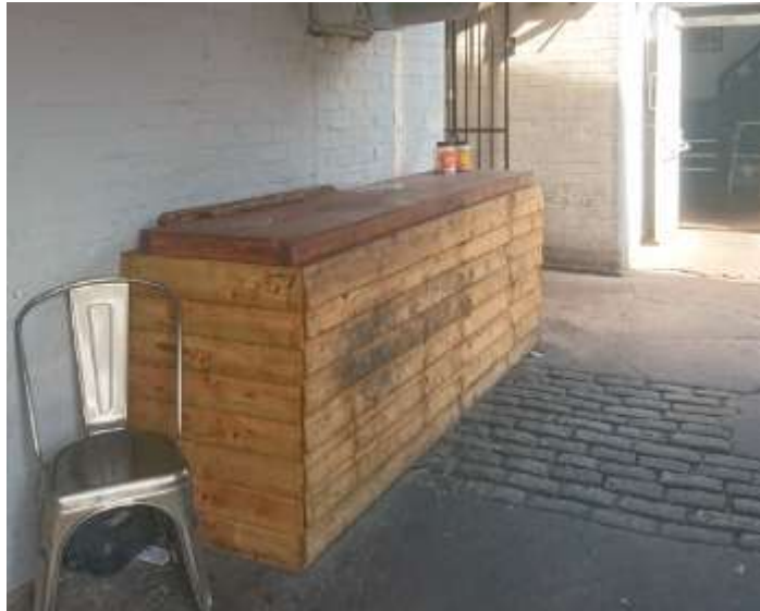
Photo 6 - Showing Storage Box B.