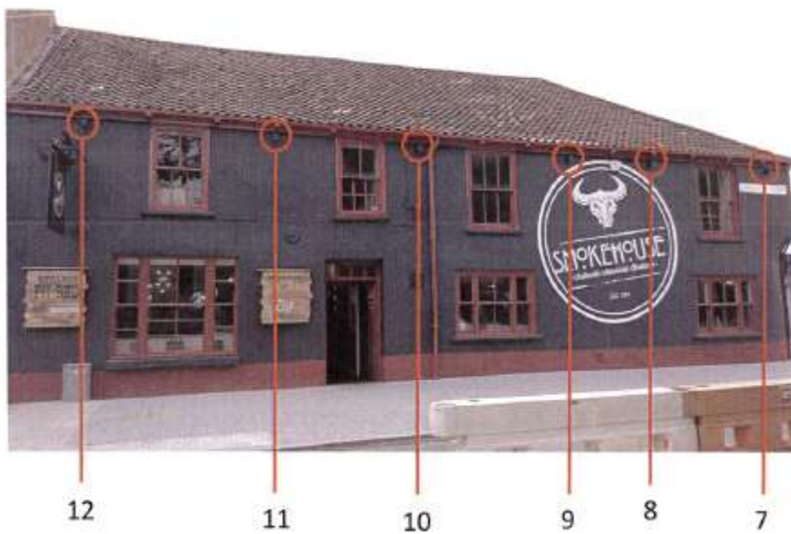
Photo 9 - Showing style of door.