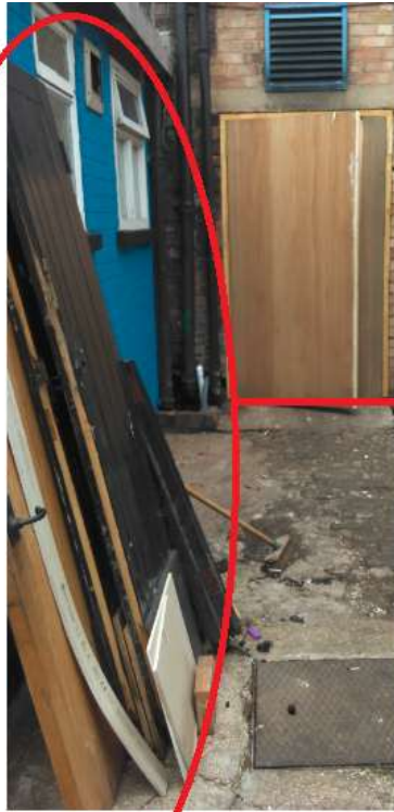
Original doors (painted black)