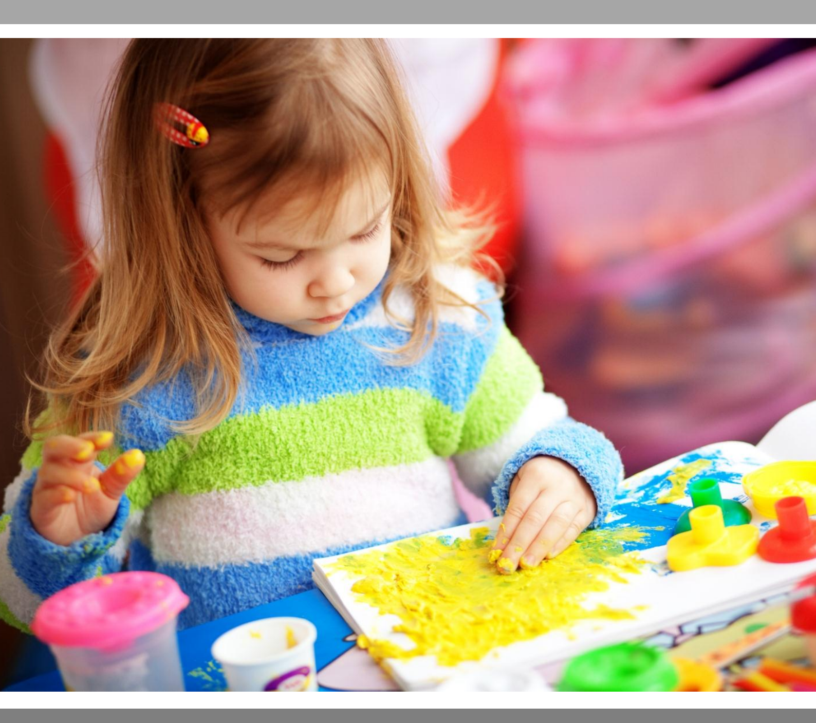
North East Lincolnshire Council Childcare Sufficiency Assessment