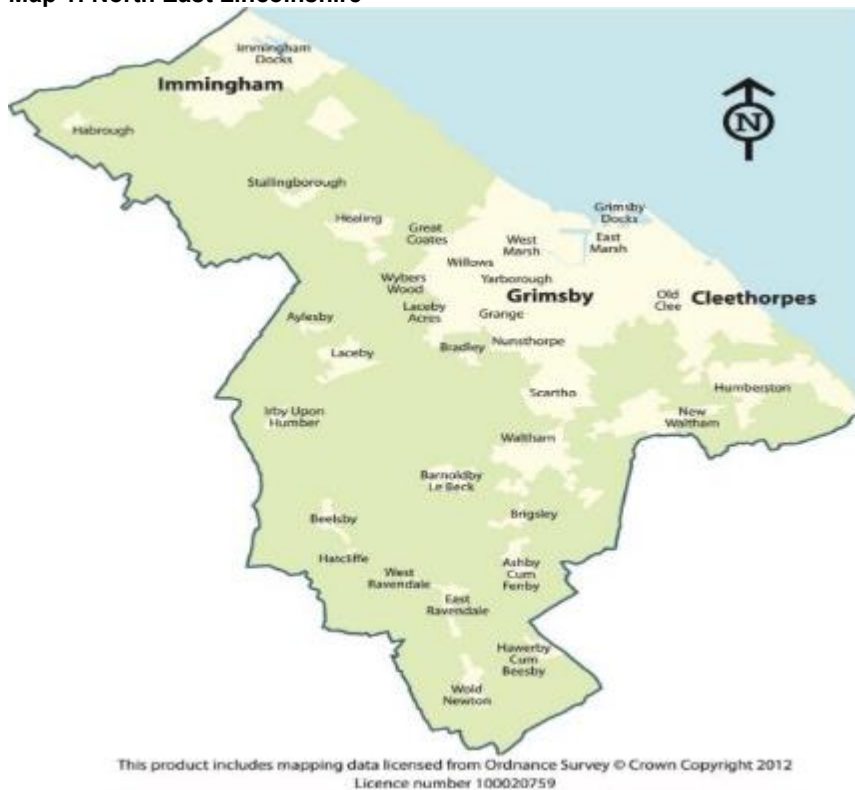
Map 1: North East Lincolnshire