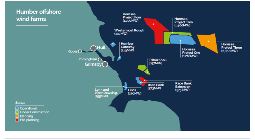
In 2016 Centrica sold Lynn and Inner Dowsing to UK Green Investment Bank Offshore Wind Fund and funds managed by BlackRocl

significant frontloaded local authority investment in Environmental Impact, Habitats Regulations and other necessary assessment work normally the responsibility of the applicant, and having secured the input and cooperation of key statutory consultees in the Environment