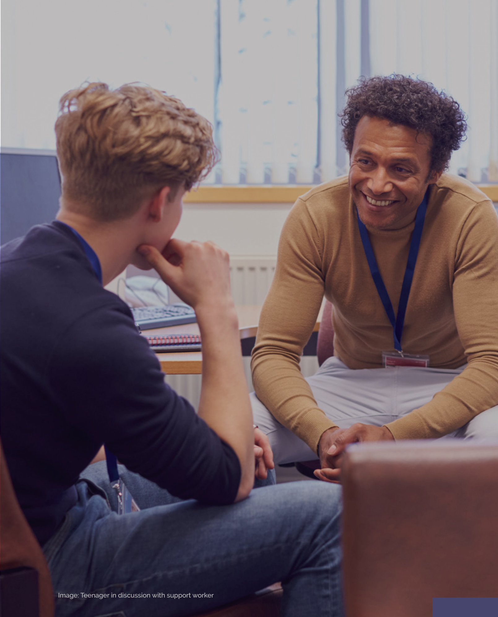
Image: Teenager in discussion with support worker