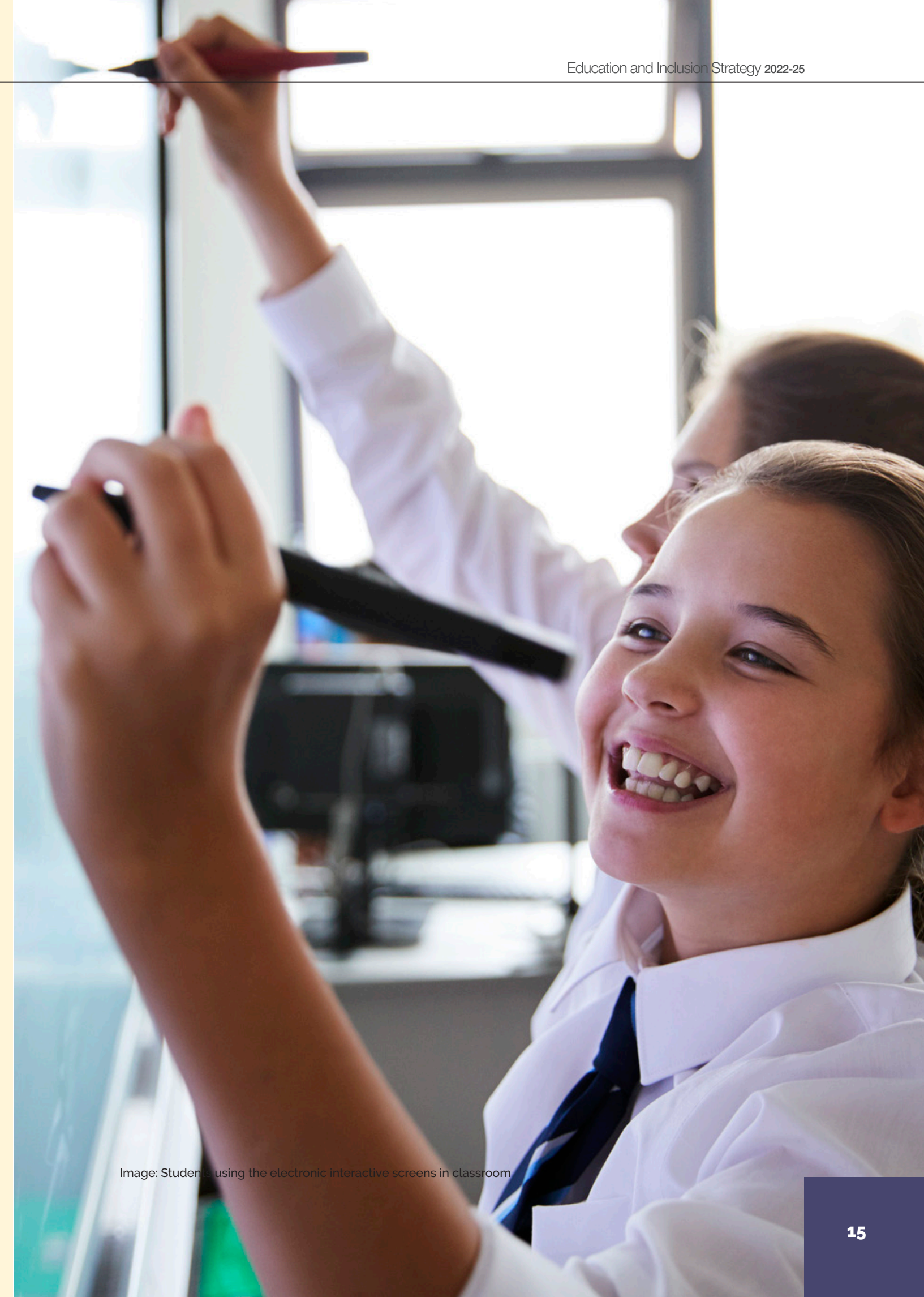
Image: Students using the electronic interactive screens in classroom