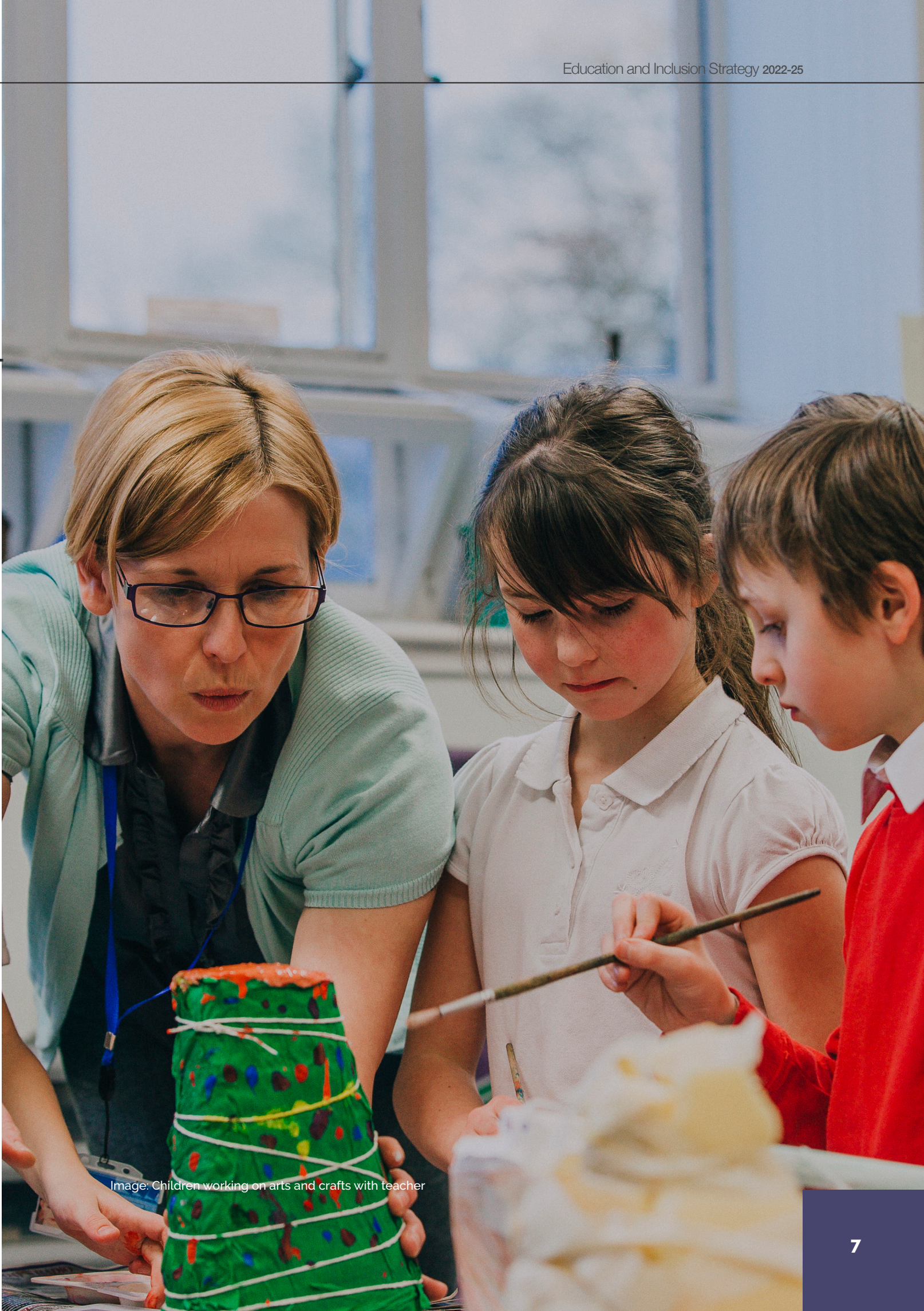
Image: Children working on arts and crafts with teacher