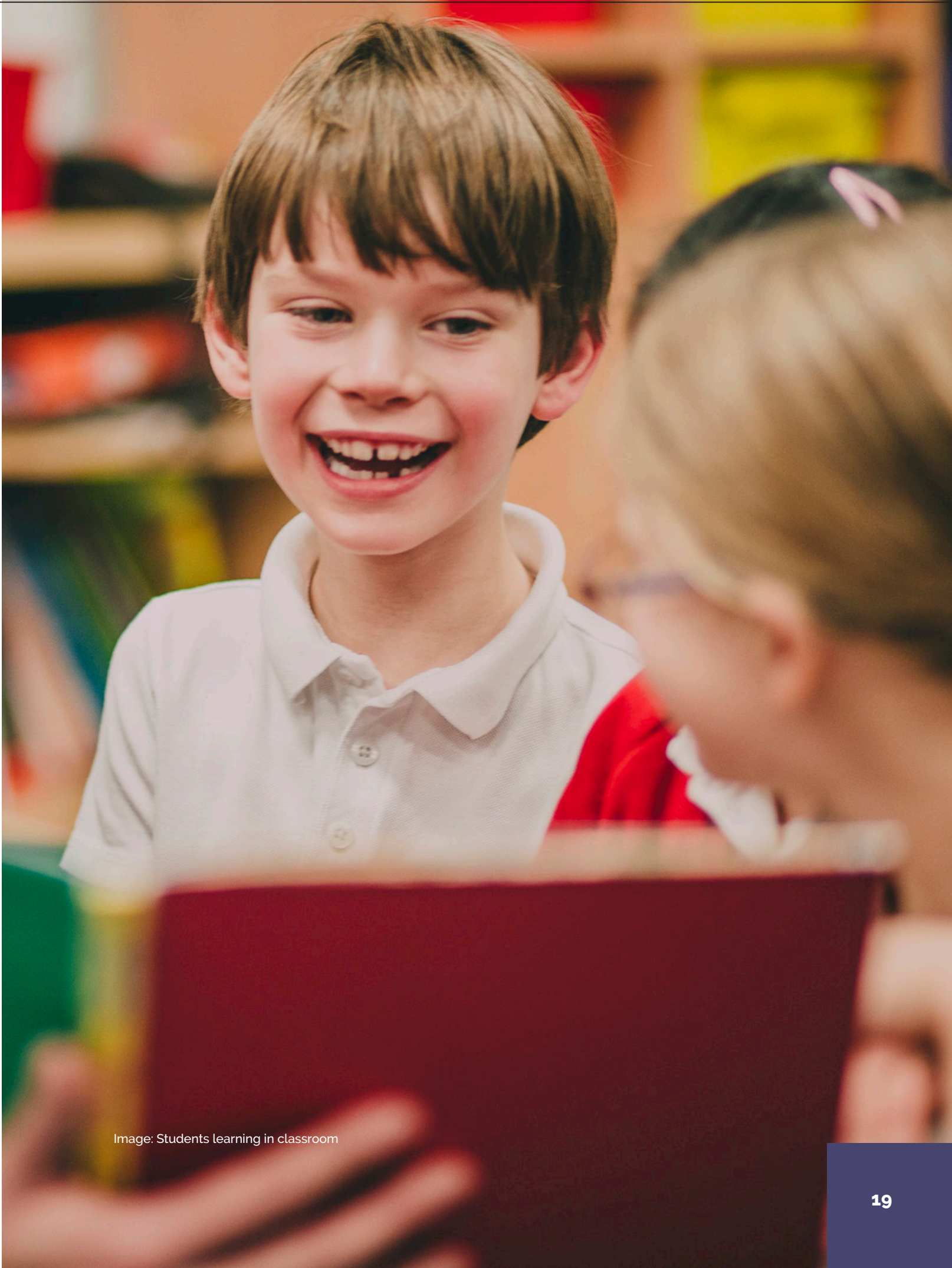
Image: Students learning in classroom