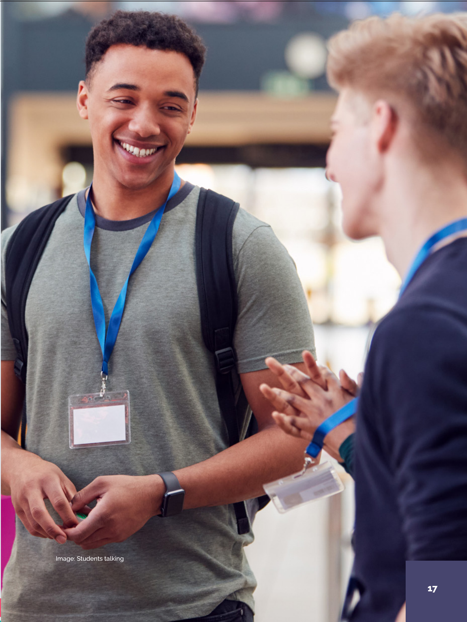
Image: Students talking