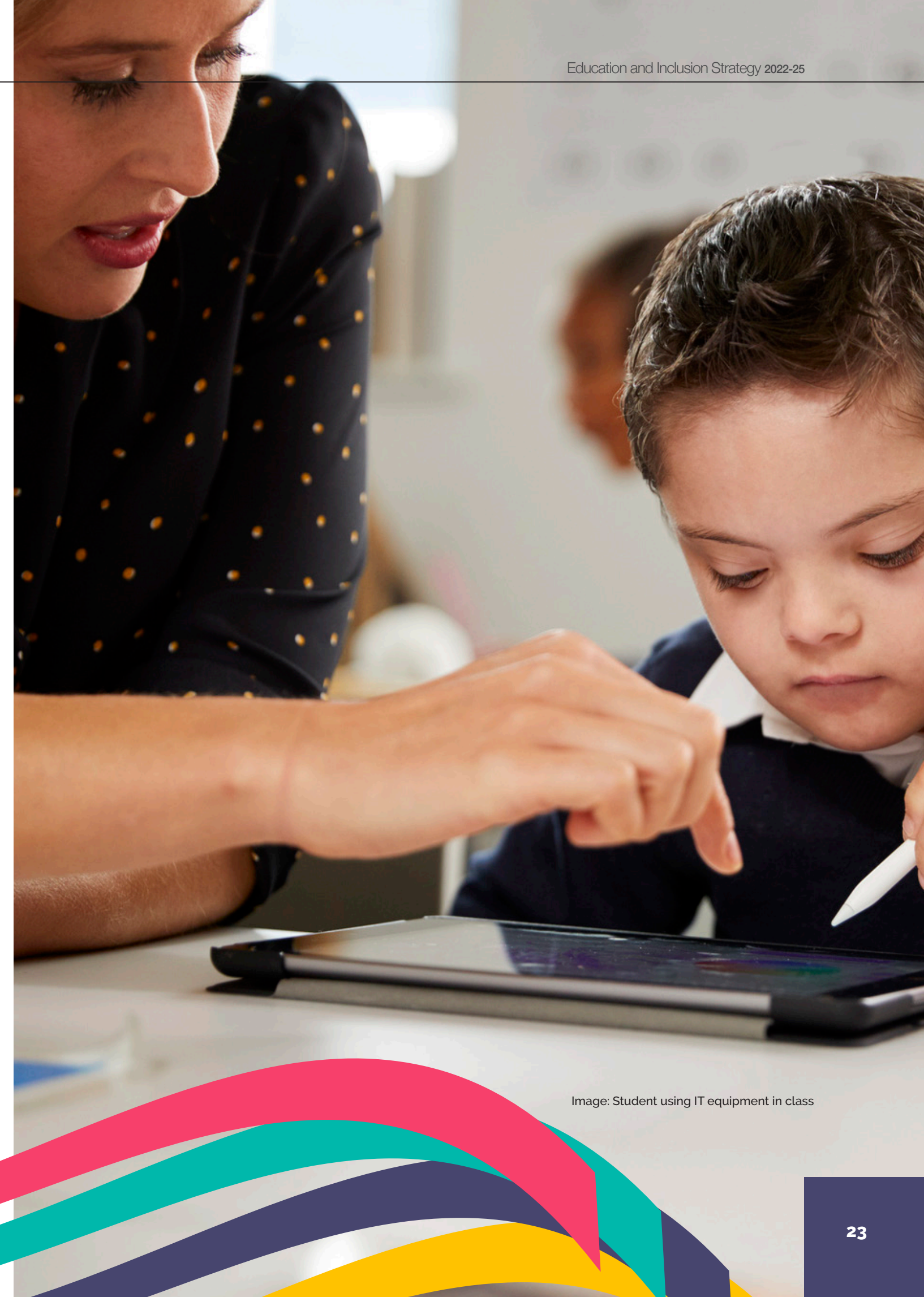
Image: Student using IT equipment in class