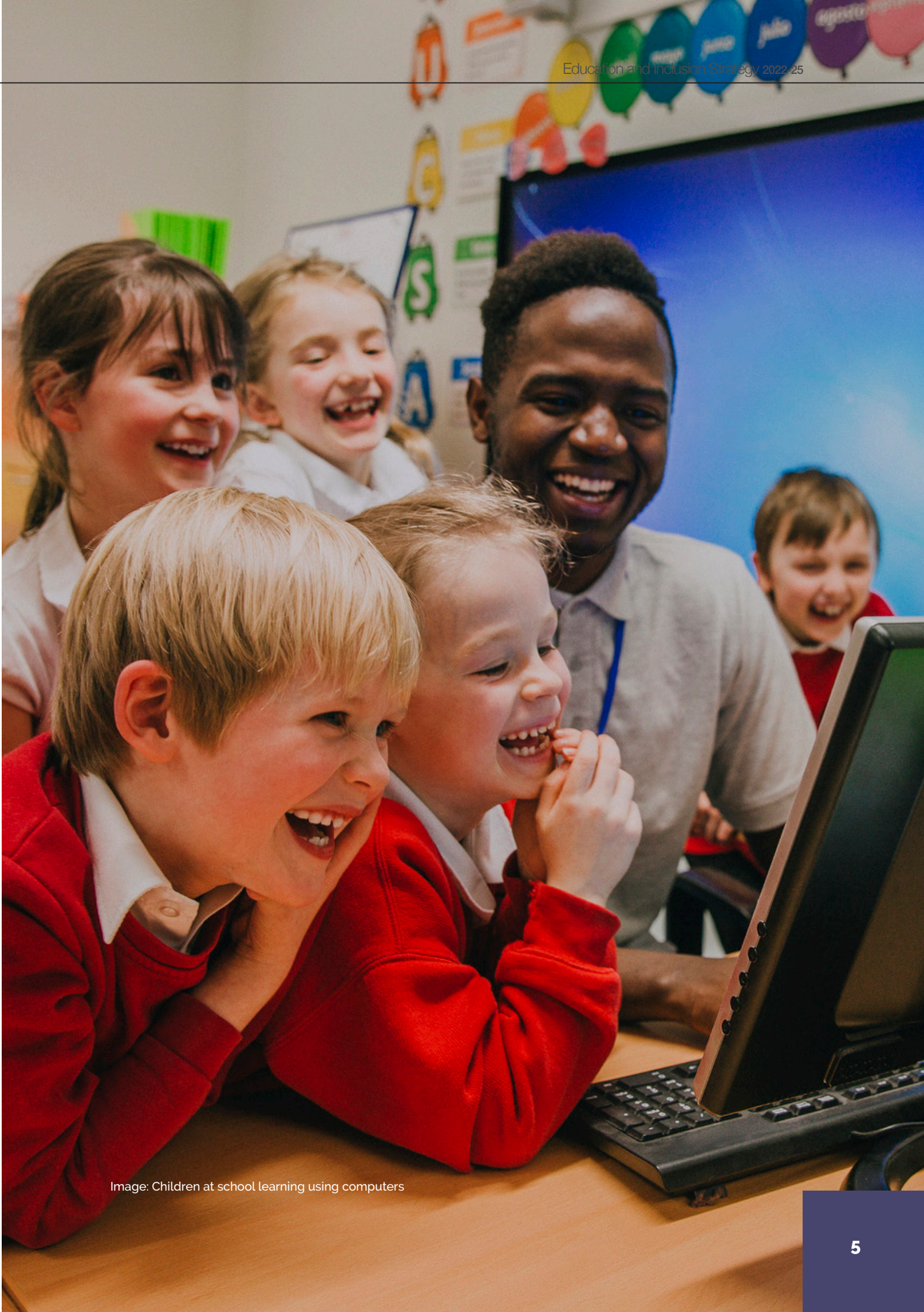
Image: Children at school learning using computers