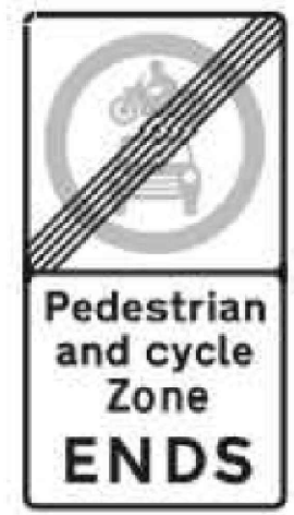
PROPOSED SIGNAGE BACK TO BACK