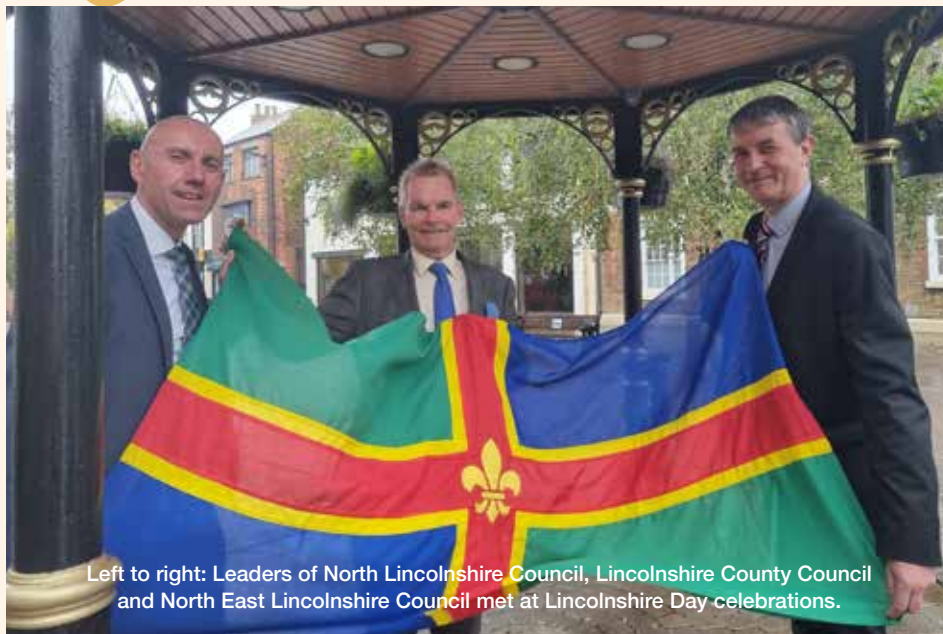
Left to right: Leaders of North Lincolnshire Council, Lincolnshire County Council and North East Lincolnshire Council met at Lincolnshire Day celebrations.

For Greater Lincolnshire there is a total investment fund of £720m over the next 30 years to invest in some key areas that will benefit us all. In fact, initial funding is already being used to support plans for 130 new homes on Alexandra Dock (alongside Garth Lane bridge) and for a new Grimsby Town Centre Transport Hub. I want to reassure you too that the