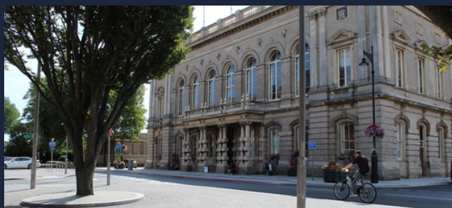
Modern Slavery Champions event Tuesday 17 th January 2023