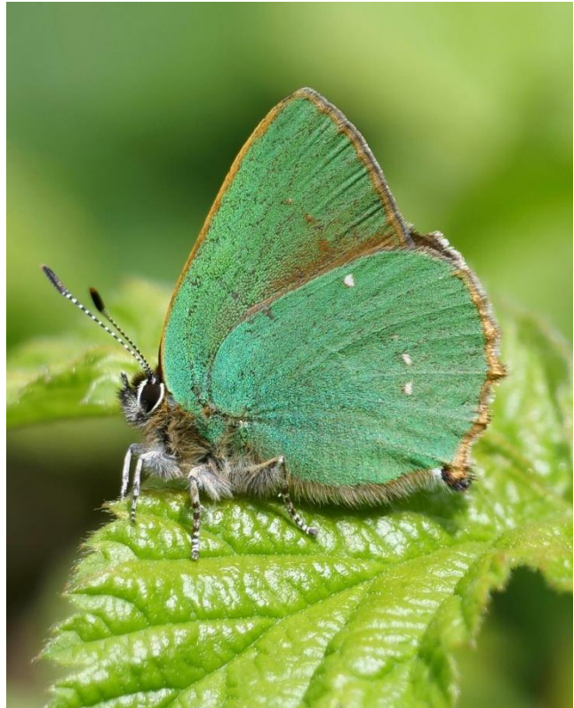
Green Hairstreak by Josh Forrester

You can find out more about our local branch of Butterfly Conservation including recent sightings and upcoming events here: Lincolnshire Branch | Butterfly Conservation