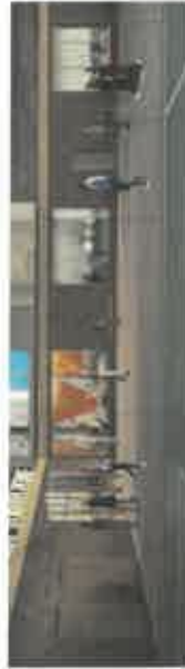
© 2019 Horizon Youth Zone. All rights reserved. Horizon Youth Zone.