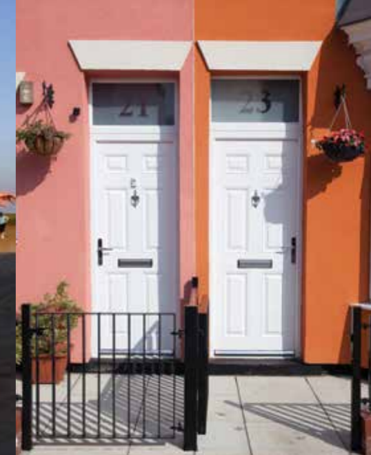
Guildford Street, Grimsby