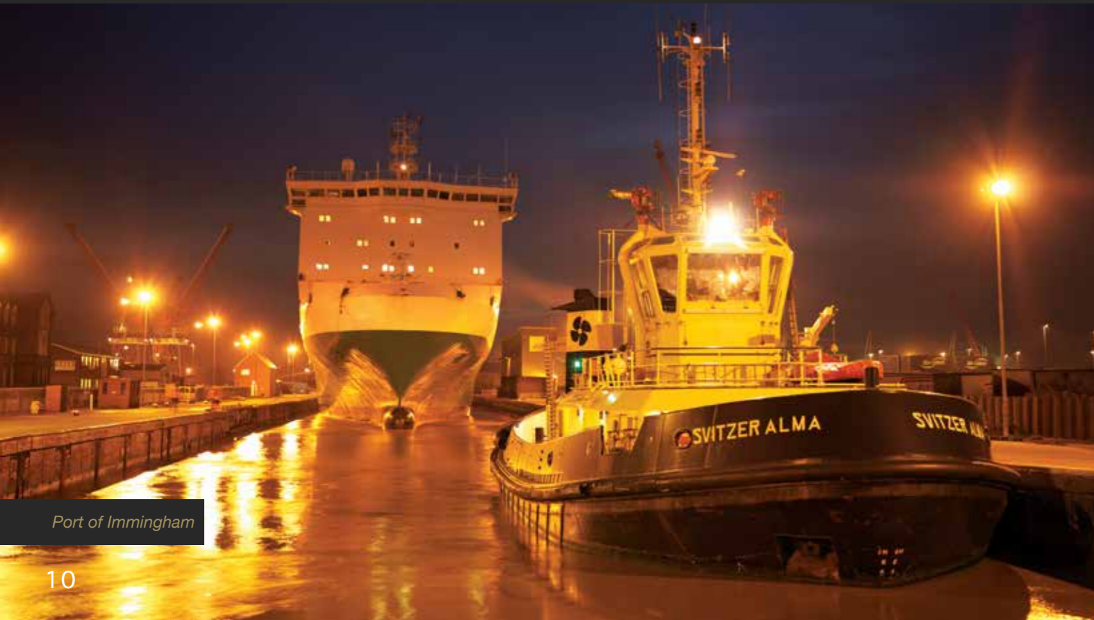
Port of Immingham

The Port of Immingham and Grimsby is the UK's largest port by tonnage and forms part of the Humber Port complex. Benefiting from a prime deep-water location on the Humber Estuary and one of Europe's busiest trade routes, it plays a central role in the commercial life of the UK and is poised to seize new opportunities that will shape our future.