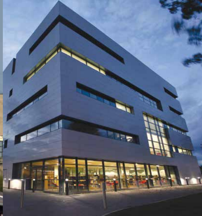
University Centre, Grimsby Institute