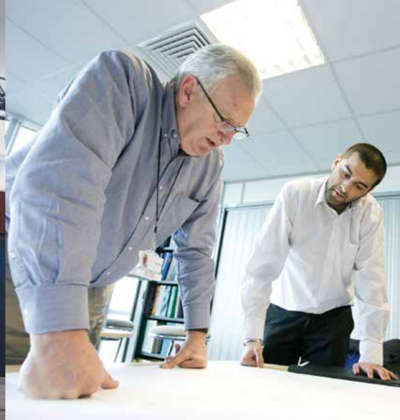
Small Business Support