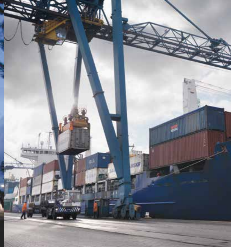
Port of Immingham