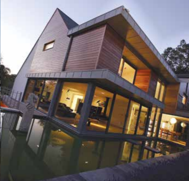
Barnoldby Le Beck