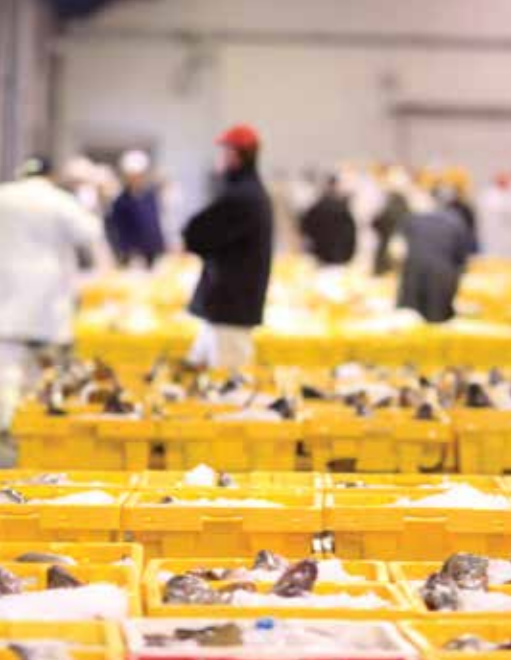
Grimsby Fish Market