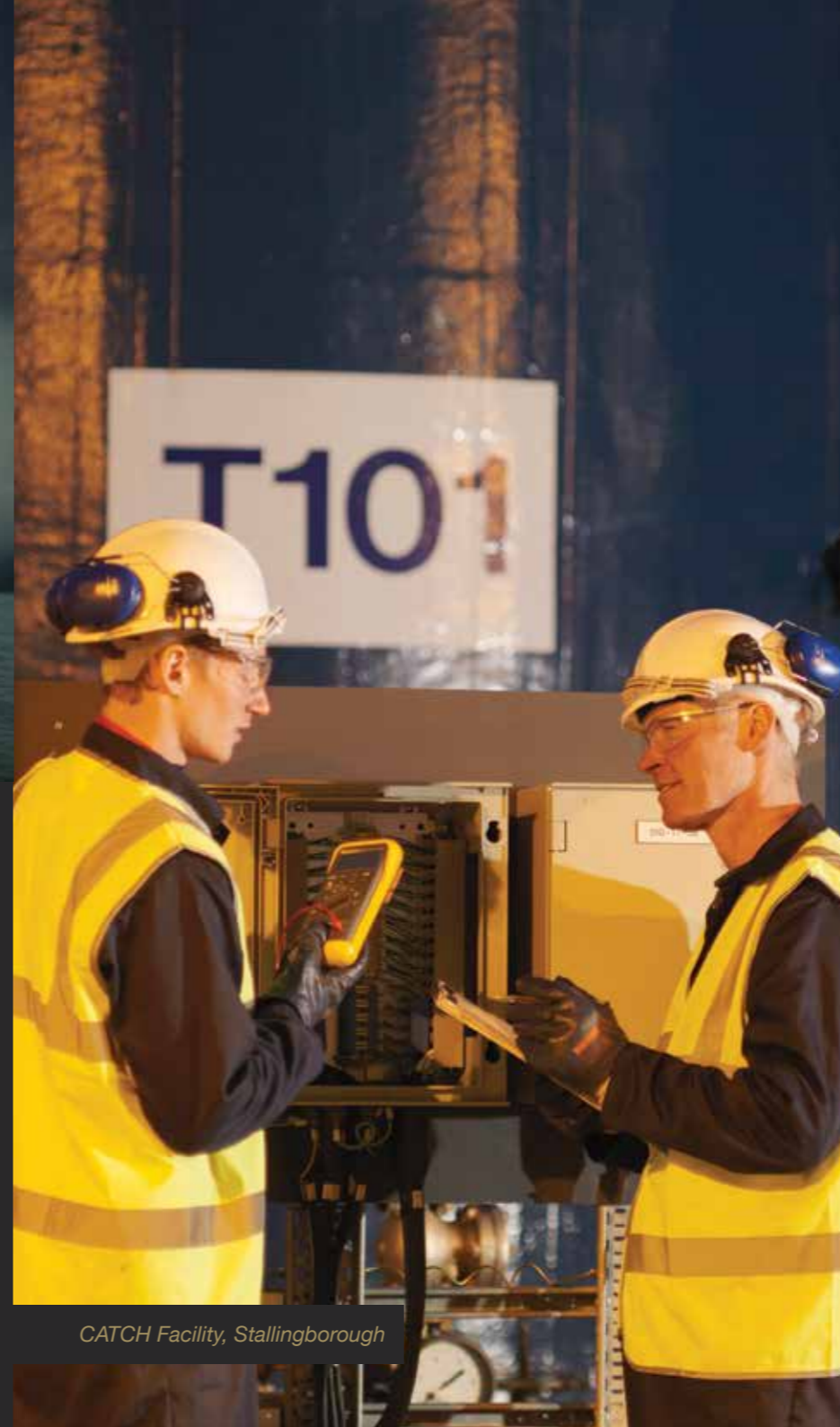
CATCH Facility, Stallingborough

As part of the government established Humber CORE, North East Lincolnshire is in close proximity to a number of the current and planned North Sea Offshore Wind Farm locations. Whilst large scale manufacturing opportunities are being developed at Green Port Hull and Able UK North Lincolnshire, Grimsby has established itself as the preferred location for operations and maintenance services, with multi-nationals such as Siemens and Centrica already located on the Port of Grimsby. With direct access to a thriving engineering supply chain, this sector is fully supported by a wealth of local expertise.