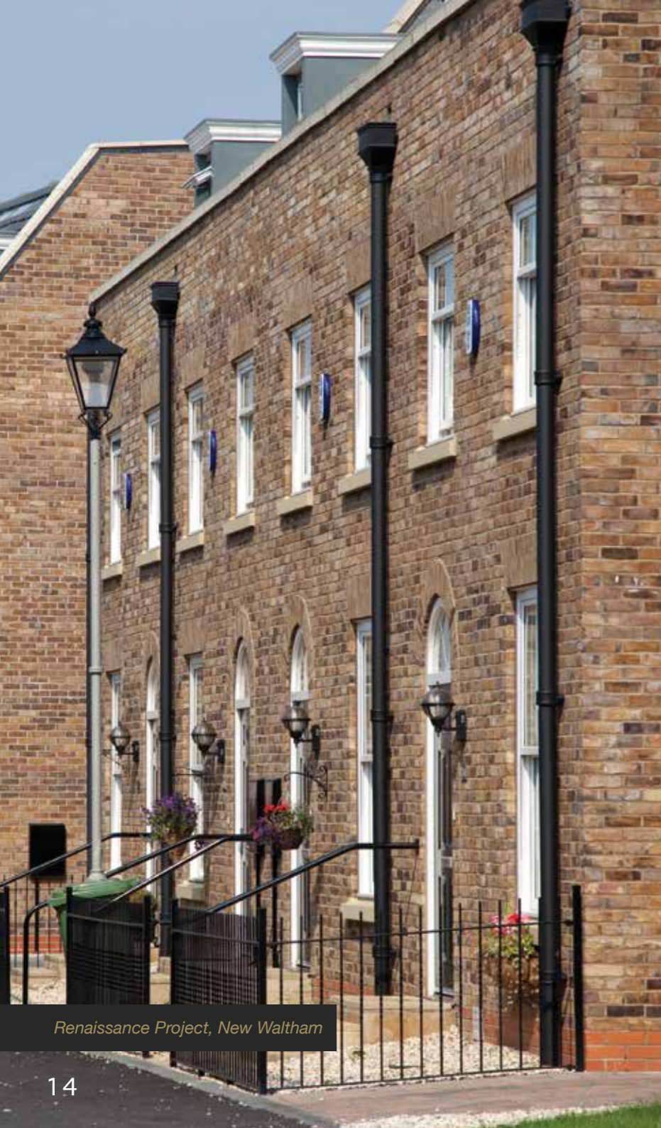
Renaissance Project, New Waltham