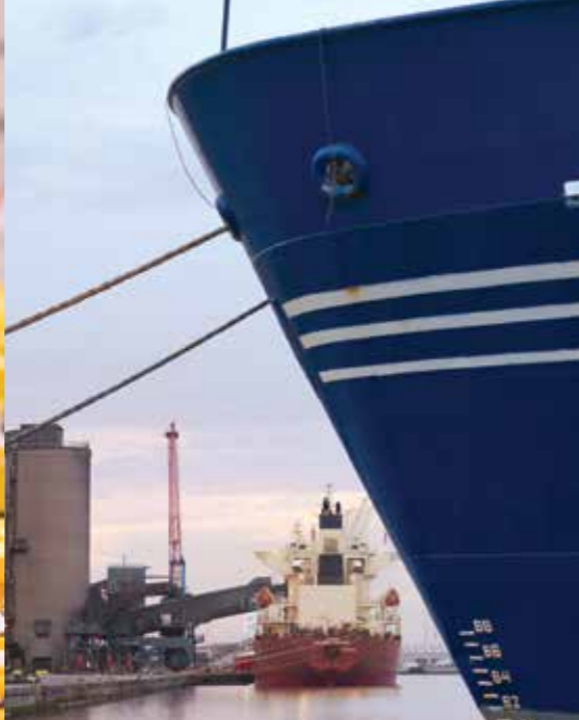
Port of Immingham