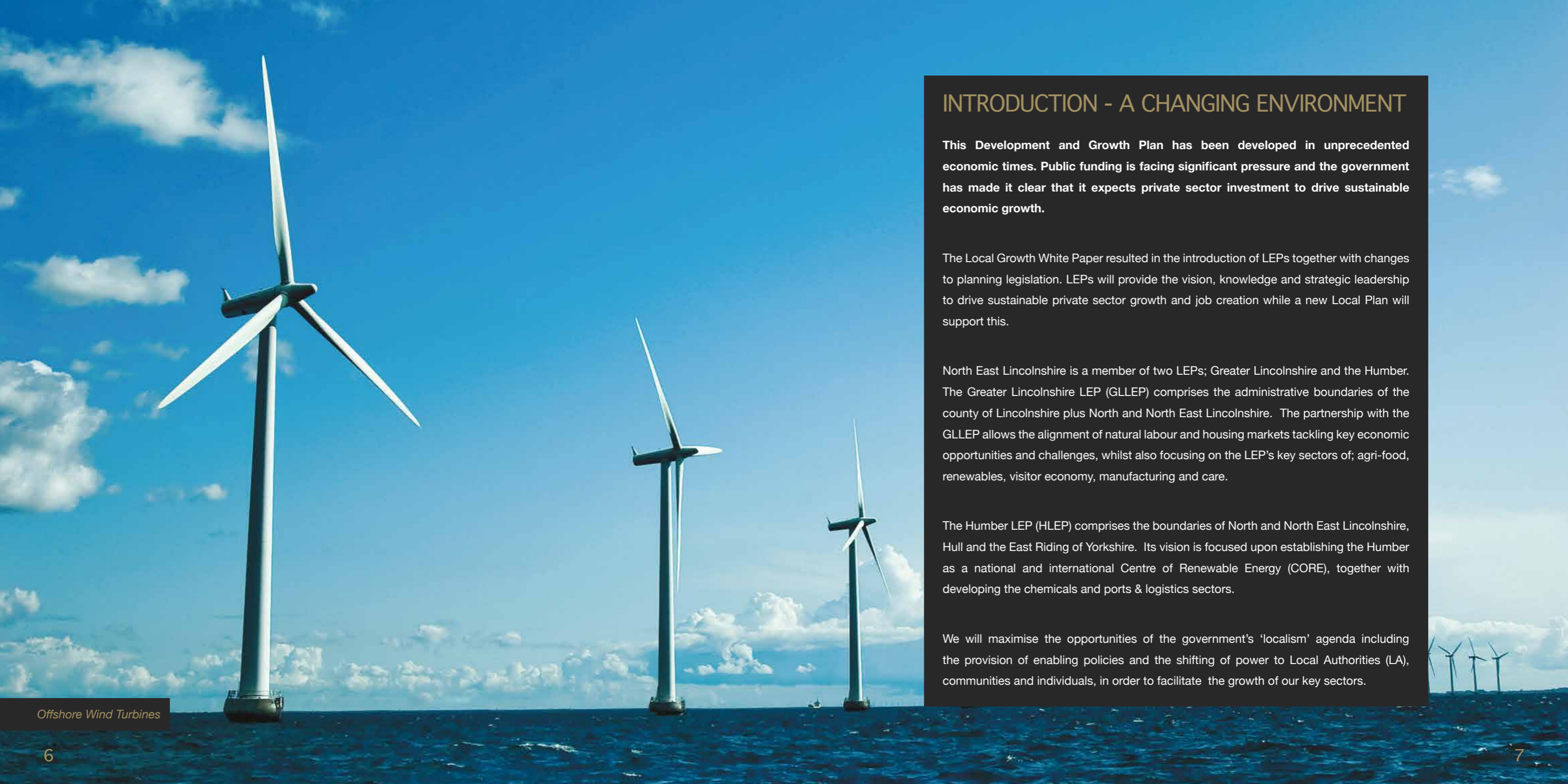
Offshore Wind Turbines