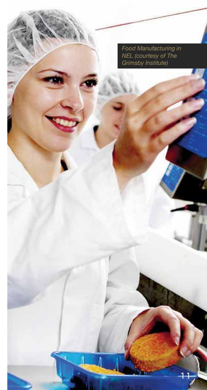
Food Manufacturing in NEL