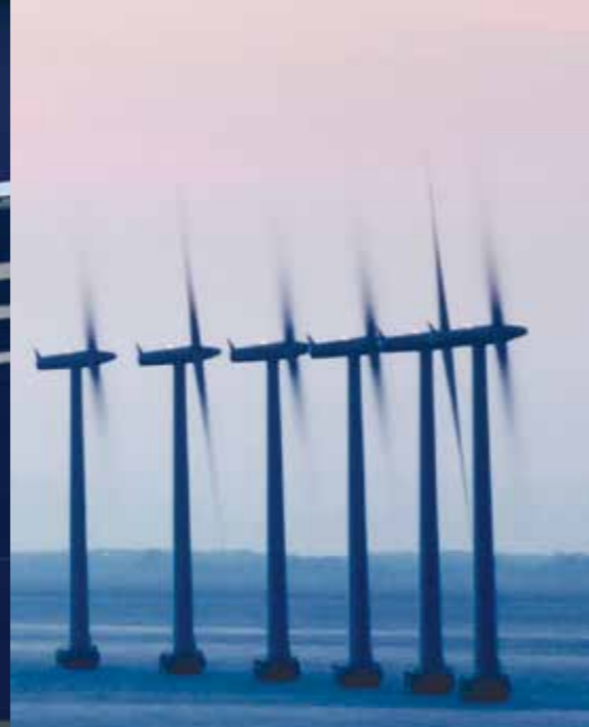
Offshore Wind Turbines