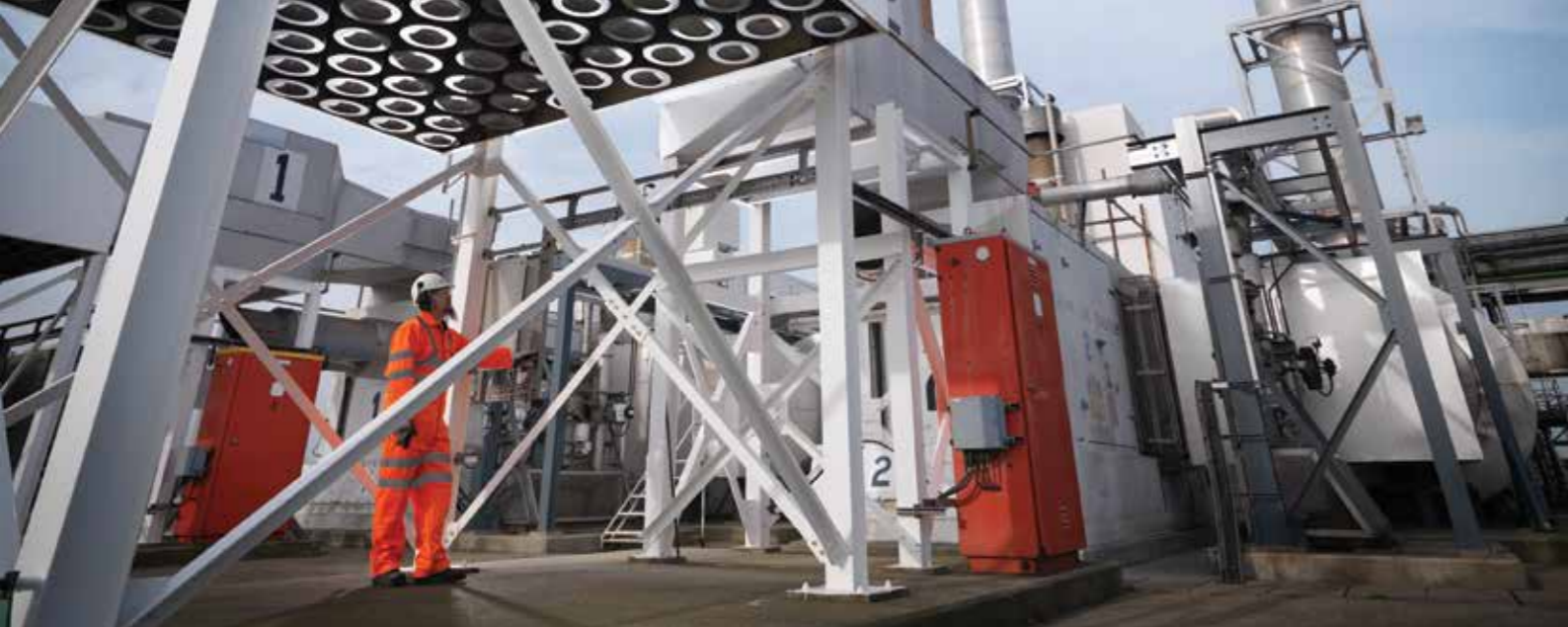
Humber Terminal, Port of Immingham