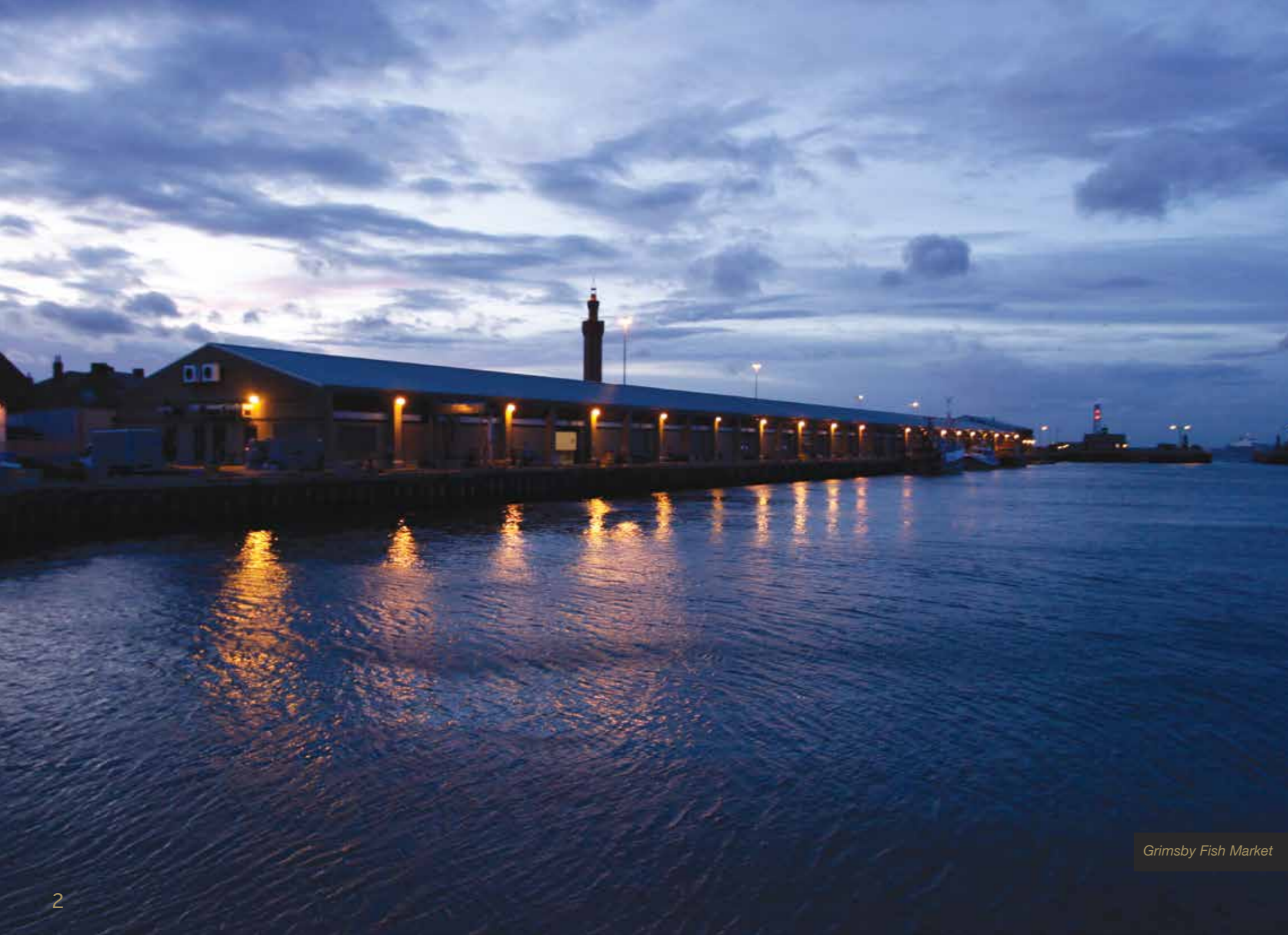
Grimsby Fish Market